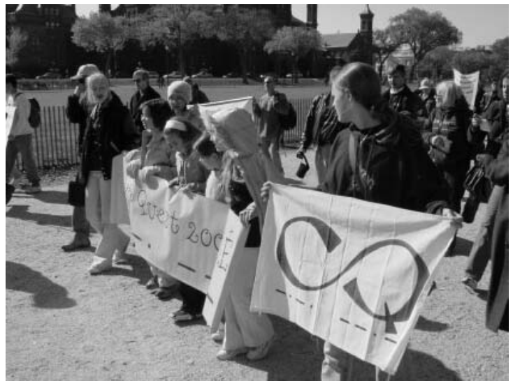
Camp Quest at GAMOW