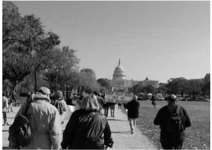
FIG Members at Godless Americans March on Washington.