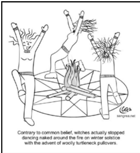
Contrary to common belief, witches actually stopped dancing naked around the fire on winter solstice with the advent of woolly turtleneck pullovers.

Many Americans will give thanks as they sit down to their Thanksgiving meals. Religious people are free to thank God for the food they are about to eat. Humanists are free to thank those who grew and prepared the food. And we are even free to recite Bart Simpson’s Thanksgiving prayer, “Dear God, we paid for all this stuff ourselves, so thanks for nothing.” And perhaps that’s the real point of what we can be thankful for in this and every season. We live in a free country with freedom of speech, with freedom to practice any religion or no religion, and the freedom to promote and advertise our beliefs. ☘