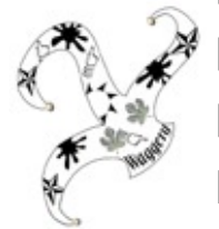
FIG Accepting Credit Card/PayPal Donations

"God made me beautiful so you would be attracted to me; God made me stupid so I would be attracted to you."