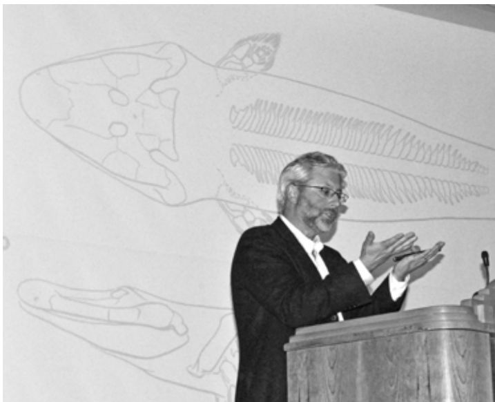
Dr. Neil H Shubin

The talk was based on Dr. Shubin's best-selling book "Your Inner Fish: A Journey into the 3.5 Billion Year History of the Human Body," published in 2008. Being a paleontologist who specializes in fish and a professor of anatomy, Dr. Shubin is in a unique position to see and study the evolutionary history of our species that is evident in the anatomical structures of ancient fish. Understanding the fossils, DNA and embryos of the creatures that preceded us is essential to understanding who we are and how we evolved.