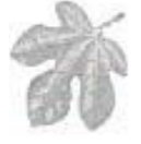
FIG Leaves P.O. Box 19034 Cincinnati, OH 45219

November Meeting: Tuesday, November 28, 2006 7:00 PM