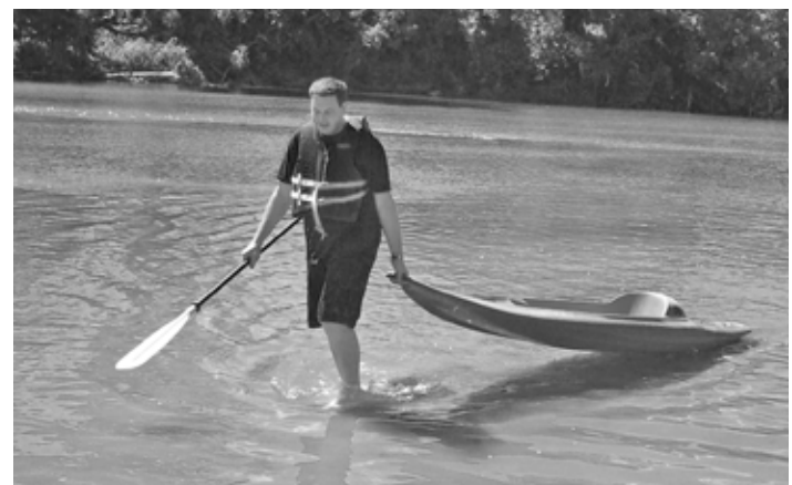
Aren't Kayaks were for sitting in?